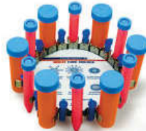
SI-V525 Vertical 50ml, 15ml, Microtube Holder