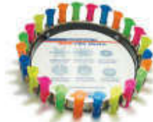
SI-V524 Vertical Microtube Holder (24)