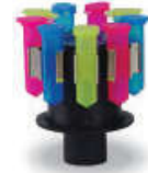
SI-V209 Vertical High Speed Microtube Holder (9)