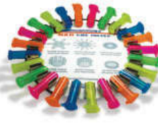
SI-H524 Horizontal Microtube Holder (24)