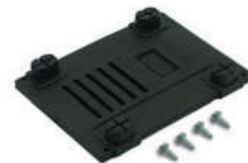
OK-0236-408 Bottom Closure with Screws Kit