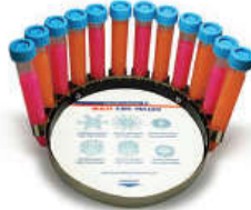
SI-V512 Vertical 15ml Tube Holder (12)