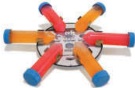
SI-H506 Horizontal 50ml Tube Holder (6)