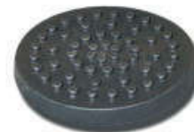
580-2013-00 Rubber Cover for 3-inch Platform

*May be used with TurboMix Attachment or Disruptor Genie. **6-inch Platform Required. ***Recessed Platform Required.