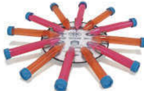
SI-H512 Horizontal 15ml Tube Holder (12)