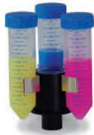
SI-V203 Vertical High Speed 50ml Tube Holder (3)