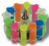
SI-0565 Universal Microtube Holder*