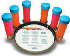
SI-V506 Vertical 50ml Tube Holder (6)