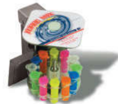
SI-0564 TurboMix™ Attachment