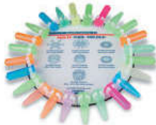
SI-HP524 Horizontal Plastic Clip Microtube Holder (24)