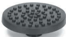
OK-0500-902 3-inch Platform with Rubber Cover